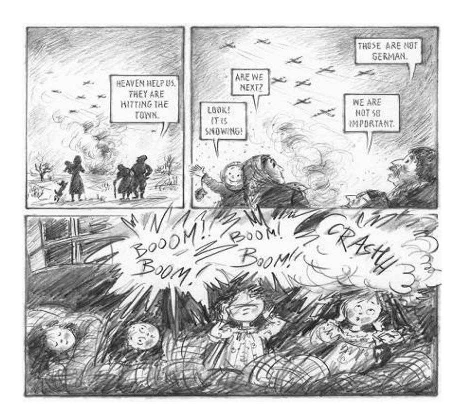
Figure 5: Miriam Katin: We Are On Our Own. Drawn & Quarterly, Copyright © Miriam Katin, 2006, page 48, panels 1-3

presents true historical event of the Warsaw ghetto upsiring with fictional heroes. The story is preceded by an introduction in which the author reports on the creative process. In spite of being fictional, the extensive research work behind the creation of Yossel: April 19, 1943 imparts historical accuracy and immense credibility to it.